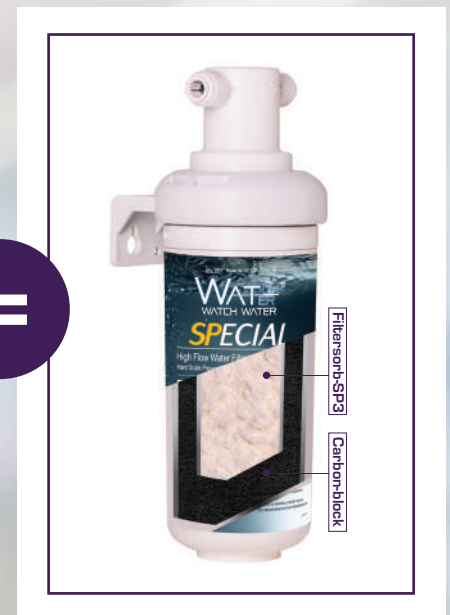
SP-510 & SP-520